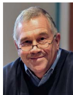
LIFETIME ACHIEVEMENT SIMON BRETT