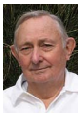
MALICE REMEMBERS TONY HILLERMAN